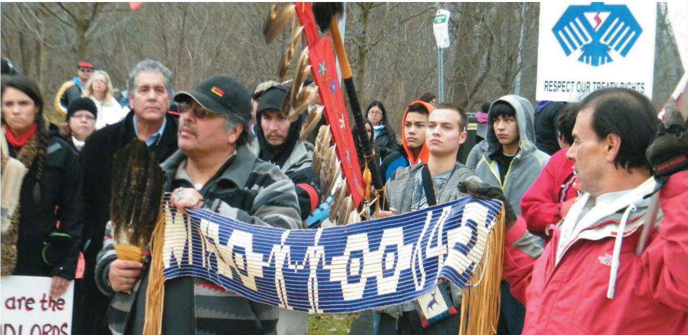
FIGURE 3.26 The 1764 Treaty of Niagara wampum belt preserves Britain’s promise to give annual gifts, in keeping with First Nations tradition, “for as long as the sun shone, and the grass grew, and the British wore red coats.” Analyze: How would you interpret the symbols in the belt?

The principles of the Royal Proclamation and the agreements woven into the Treaty of Niagara wampum belt are central to negotiations between First Nations and the Government of Canada today. Many consider these artifacts to be among Canada’s first constitutional documents to guarantee Aboriginal rights. Protests like the one shown in Figure 3.27 were held across Canada starting in November 2012 to remind Canadians of agreements made hundreds of years ago.