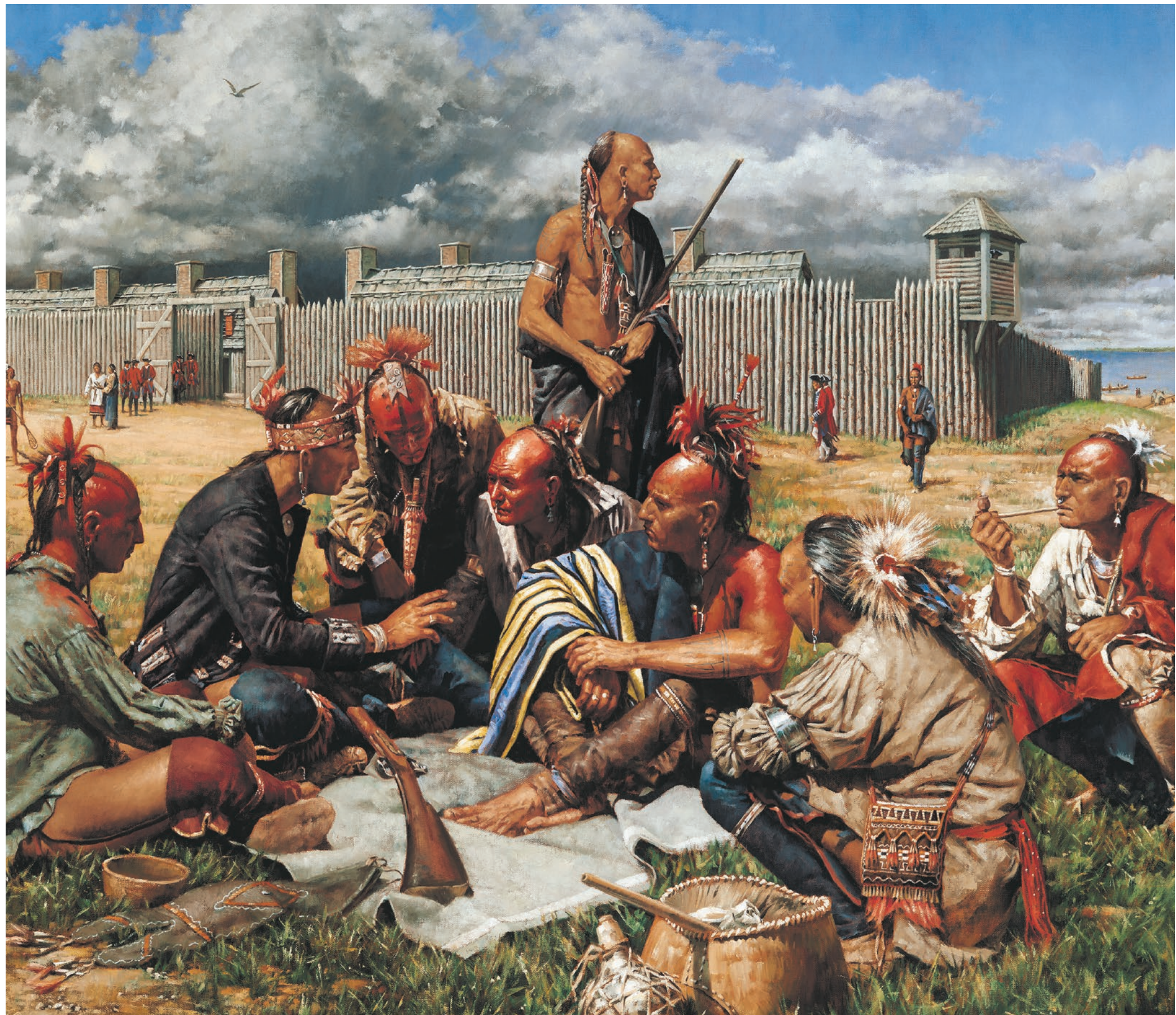
FIGURE 3.24 This 2003 painting by Robert Griffing is entitled The Conspiracy—Fort Michilimackinac . Analyze: What do you think this group is discussing?

FIGURE 3.23 This excerpt is from Henry's account of the First Nations attack on Fort Michilimackinac in 1763. Analyze: How was the game of bag'gat'iway an effective cover for the attack?