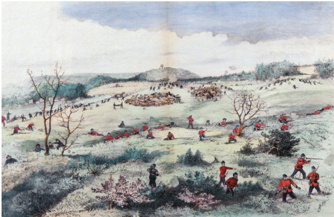
FIGURE 4.23 This lithograph, entitled Battle of Cut Knife Hill, 1885 , was published in the Canadian Illustrated War News . It shows the government troops attacking Chief Poundmaker’s camp at Cut Knife Hill. Analyze: How does this representation help you to understand the events of the battle?

Otter led 325 government troops in an attack on Chief Poundmaker’s camp at Cut Knife Hill on May 2, 1885, as shown in Figure 4.23. Was the government justified in carrying out this attack? Led by War Chief Fine Day (Kamiokisihkwew), the Cree and Assiniboine hid in bushes and trees. Chief Fine Day used signals from a hand mirror to direct his men to attack Otter’s troops from all sides. The government’s guns quickly broke down and Otter’s troops became targets in the open field. The Cree and Assiniboine men forced Otter’s troops to retreat. Chief Poundmaker, who did not participate in the fight, stopped his men from pursuing the defeated troops.