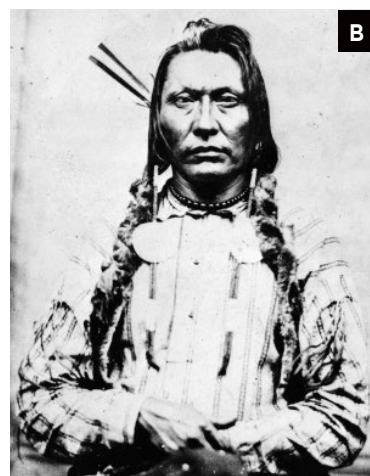
FIGURE 4.13 (A) A quote from Chief Big Bear in 1875 in response to treaties the federal government had planned for First Nations. (B) A photo of Chief Big Bear taken in 1888. Analyze: What is Chief Big Bear comparing the federal government treaties to?

— Chief Big Bear, Plains Cree First Nation