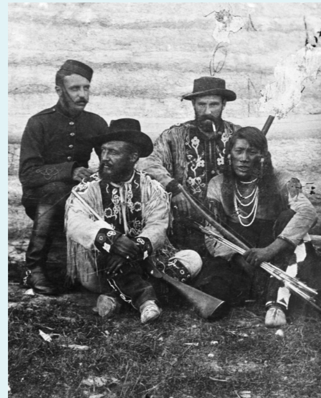
FIGURE 4.21 North-West Mounted Police officers and an unidentified First Nations man pose for a photo at Fort Walsh, Saskatchewan, in 1879. Analyze: What is the significance of the two officers wearing First Nations clothing?

For a while, relations between the North-West Mounted Police and First Nations peoples were positive. First Nations and Métis people were hired and consulted as guides and scouts. The North-West Mounted Police protected First Nations peoples from violent whisky traders and provided food to those facing starvation. The positive actions of the North-West Mounted Police helped the federal government persuade First Nations peoples to sign treaties. The North-West Mounted Police began to build posts throughout the Northwest region. Figure 4.21 shows officers and a First Nations man at Fort Walsh, Saskatchewan. This fort is at the site of the Cypress Hills killings, which you learned about in Chapter 3. Fort Walsh eventually became the headquarters for the North-West Mounted Police. Examine Figure 4.21 . What can you infer about the relationship between First Nations and the police from this photo?