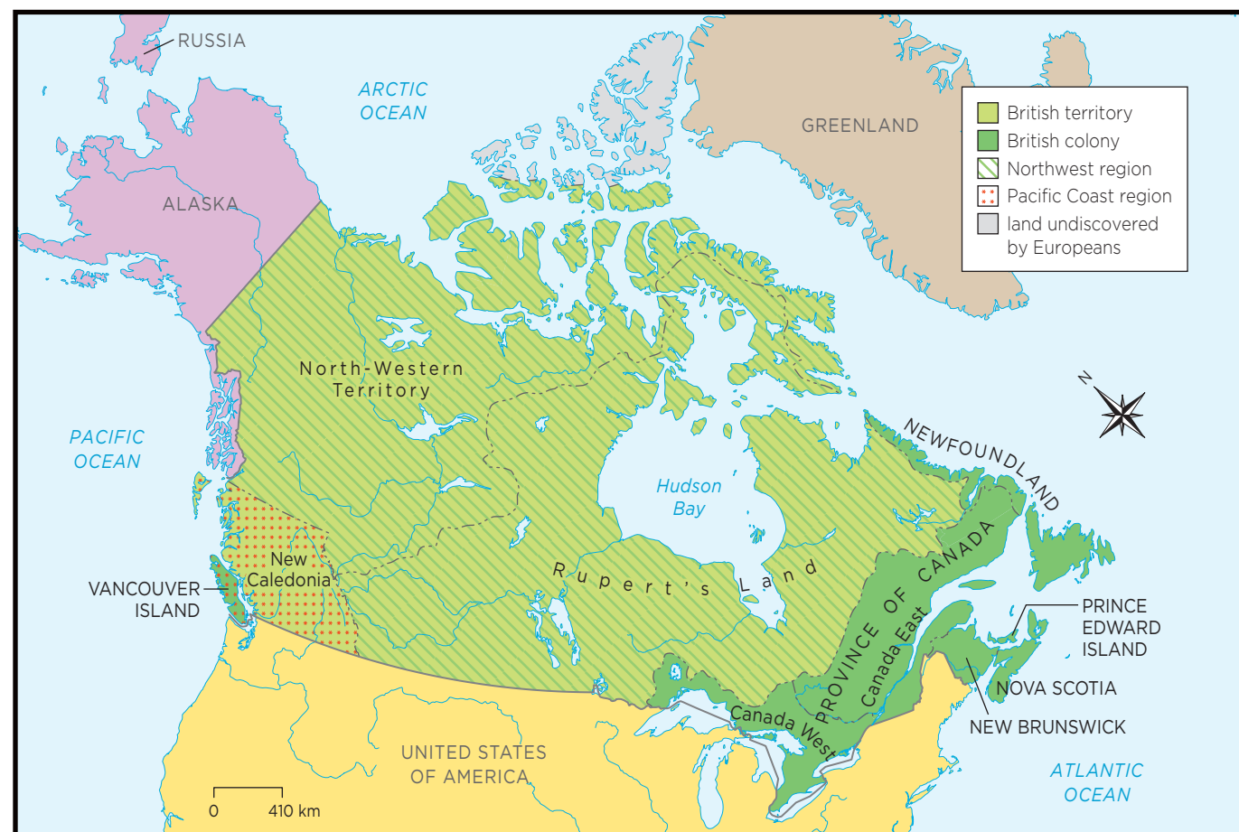
British North America and Surrounding Areas, 1850