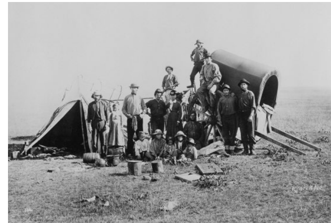
FIGURE 1.29 This 1872 photo shows a group of Red River Métis traders. Analyze: What do you see in this photo that shows the influence of European culture on the Métis way of life?

in the mid-1800s. Read the excerpt from one of his memoirs in Figure 1.30 . What changes is Goulet observing in the Red River Settlement?